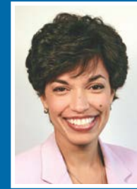
Featuring Keynote Bonnie St. John!

A $1,000 donation helps one person complete the entire jobs program and secure sustainable employment earning up to $18,000 per year, which gives back to the whole community. A new job means the difference between having sustenance or living in poverty.